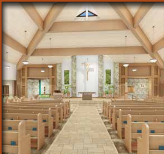
OUR CHURCH...APRIL 2019!