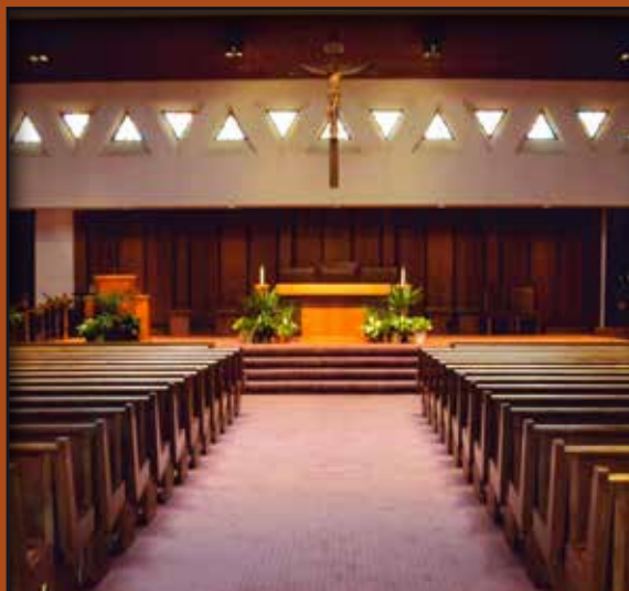
OUR CHURCH - PRESENT DAY