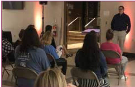
Hearing a talk at a FIAT night

Sunday evenings starting with 5pm Mass followed by FIAT from 6-8pm in Hilbert Hall. Great food, friendship, discussion and growing in faith. More info at www.myFIAT.us or call the Youth Ministry Office at 330.460.7387.