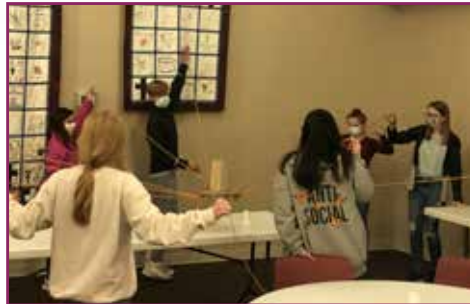
Our teens doing a fun and socially distant team builder