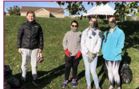
FIAT Teens Helping at the Community Day of Service